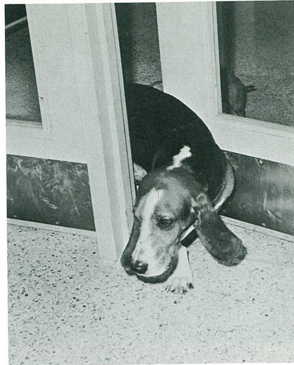
who come to see us...