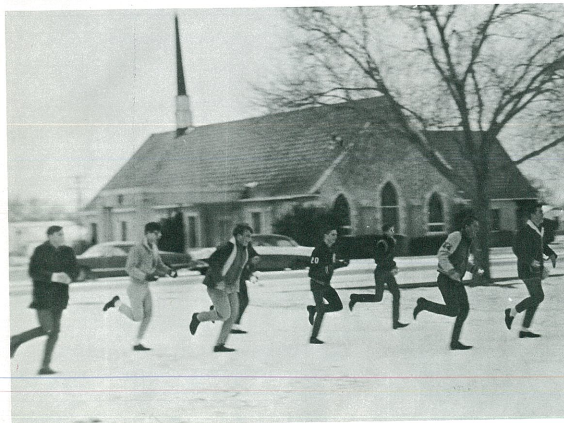
Last one there is a Sophomore?