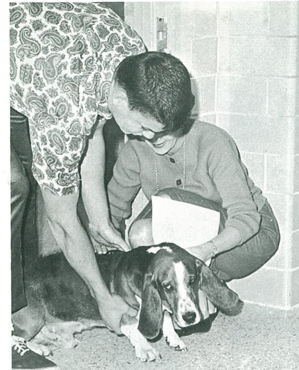
but seldom get to stay.